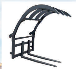
加上抓 Upper Clip